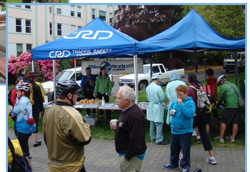
VIHA Riders connect with colleagues and enjoy refreshments at the Celebration Stations at Nanaimo Regional General Hospital (above) and Royal Jubilee Hospital (right).