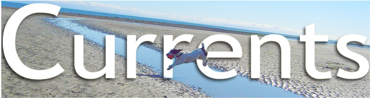
'Junior on Miracle Beach'